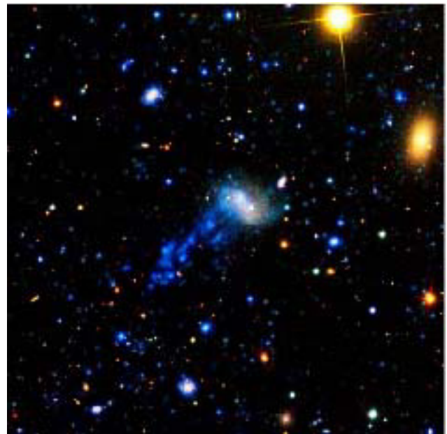
IC 3418 and its turbulent wake of newborn stars

“It’s a fascinating case of turbulence [rather than gravity] trapping the gas, allowing it to become dense enough to form stars,” says Janice A. Hester of the California Institute of Technology in Pasadena. “Astronomers have long debated the importance of gravity versus turbulence in star formation. In IC 3418’s tail, it’s all turbulence.”