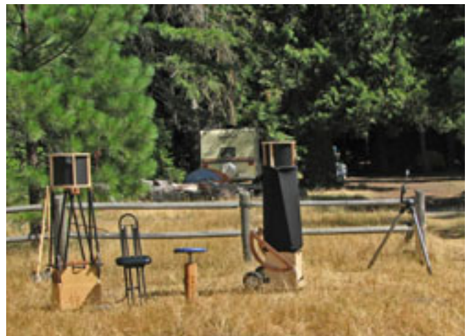
The nearer observing site with the camp beyond

A few dozen objects logged, mountain lake swims every day, clean mountain air, stars aplenty. A fine, fun campout.