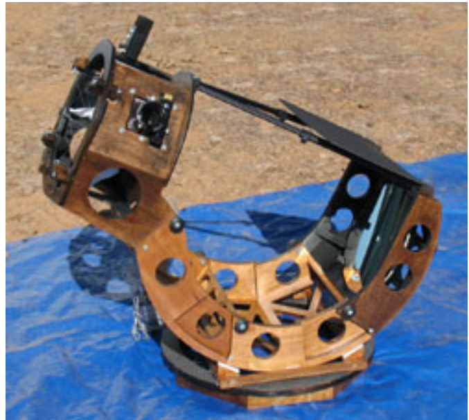
Mel's 13" f/3 folding scope

Mel unveiled another of his innovative telescope designs: a 13" f/3 that folds down into a package no bigger than a small suitcase. It's not much taller when unfolded. It was strange to find oneself bending down to look through a 13" scope even while it was pointed at the zenith. And the f/3 focal ratio didn't adversely affect the view at all. With a paracorr ahead of the eyepiece there was none of the coma you'd expect to see from such a short focal ratio, even in an Ethos eyepiece's 100-degree field.