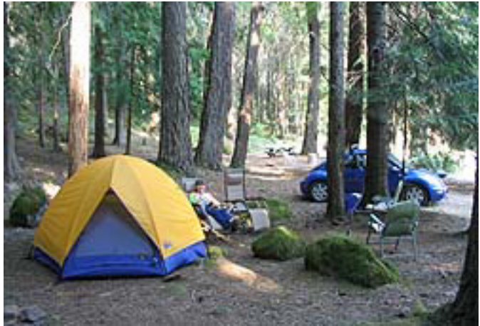
Camping at Sacandaga

There's room for many more campers and many more telescopes than we had this year. Next summer you should consider going, too. Don't miss out on all the fun!