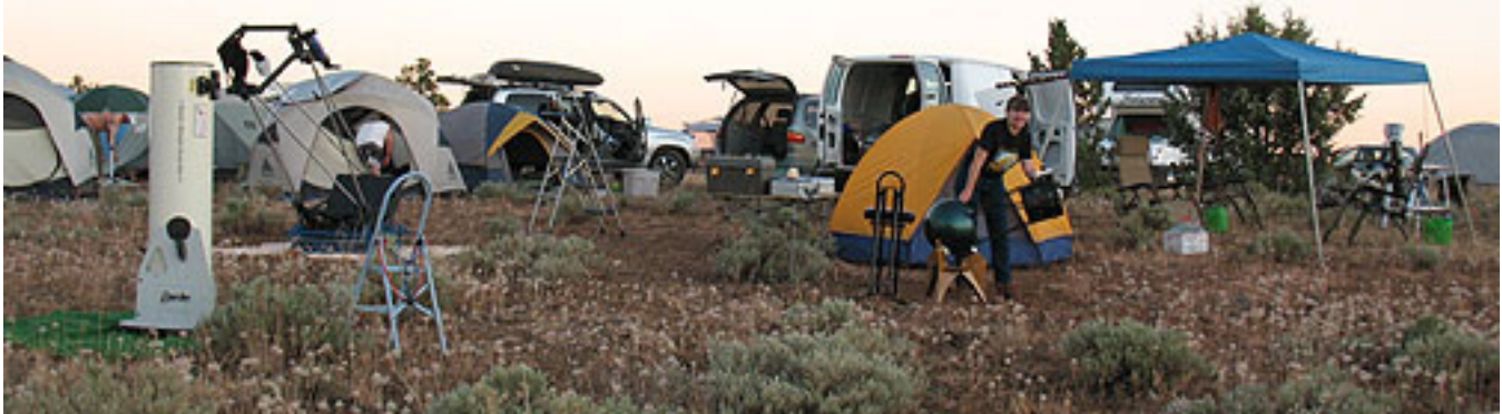
Camping out at OSP