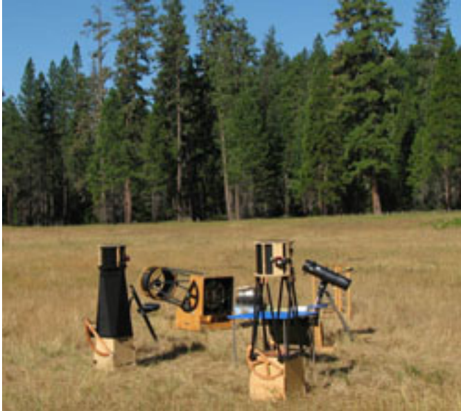
The mid-field observing site

This year we brought a some different equipment to the 2 nd EAS Dark Sky Campout: my new 6" f/5 alt-az mounted reflector, scope mounted laser pointers, and new night-sky specific eyeglasses. Each proved their worth in this dark sky outing.